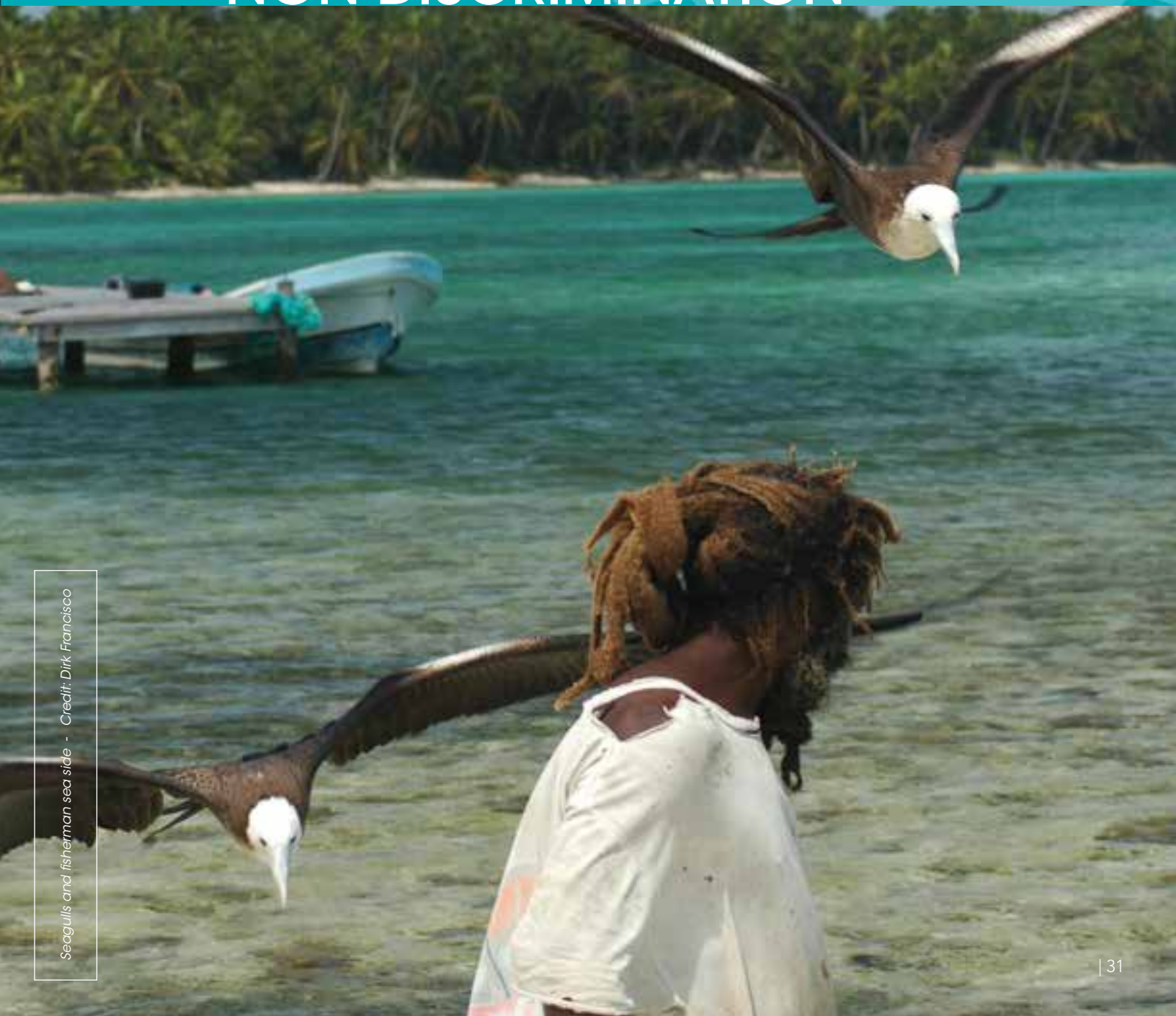
Seagulls and fisherman sea side