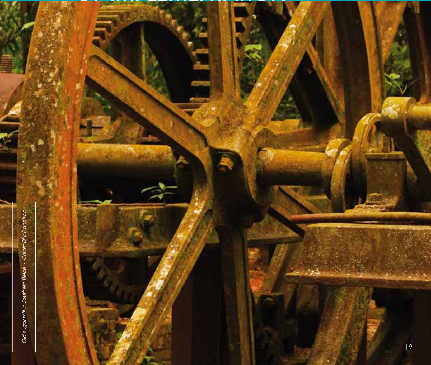
Old sugar mill in Southern Belize