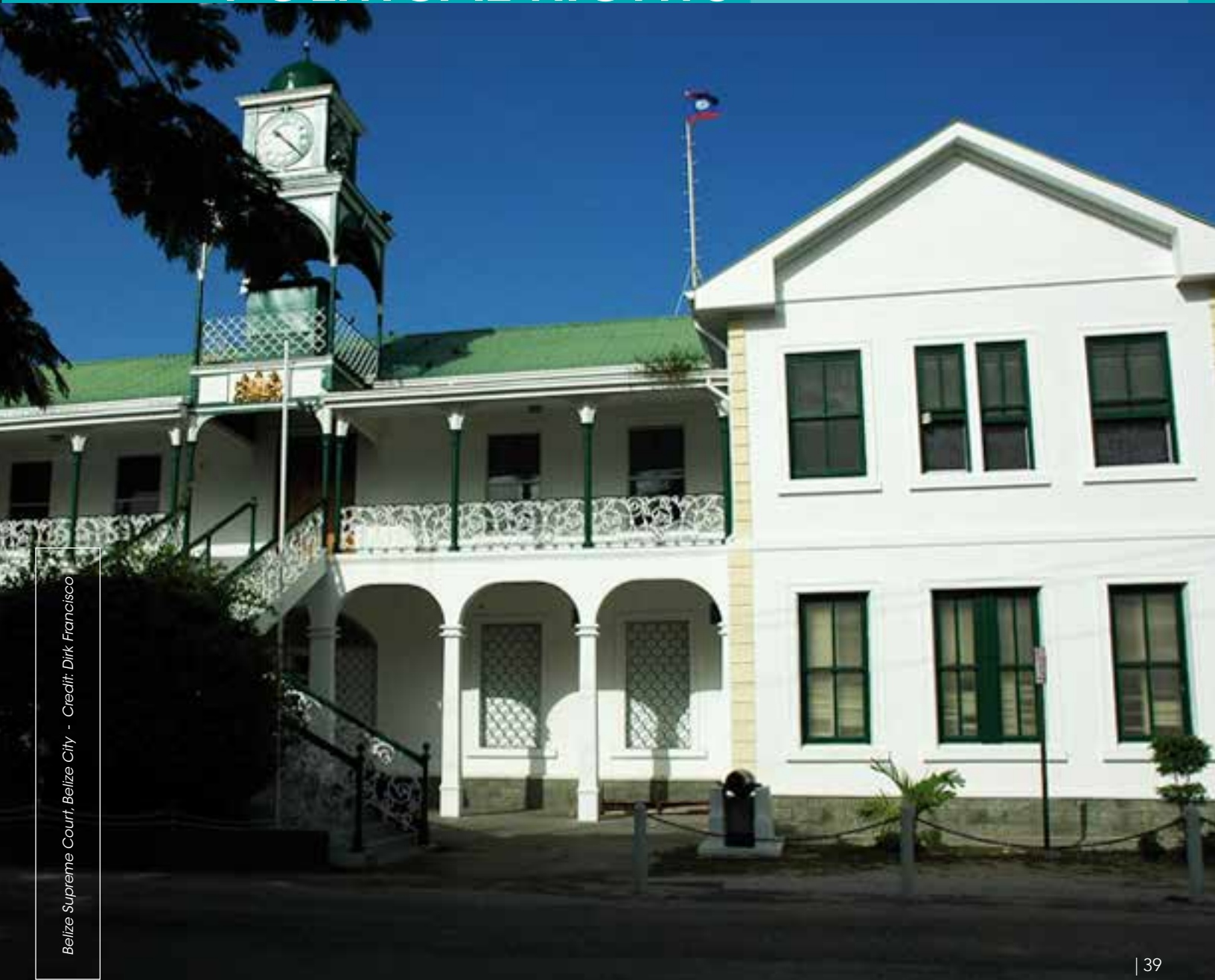
Belize Supreme Court, Belize City